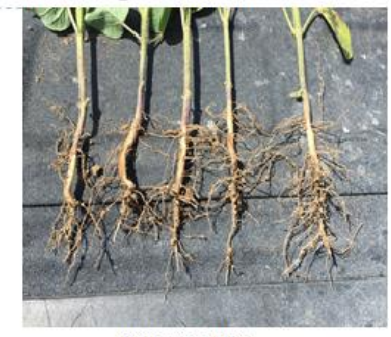
NO Eco Tea HDI – Planted July 8, 2017, Pictures taken July 25<sup>th</sup>, 2017