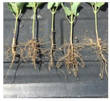
Eco Tea HDI -Planted July 8, 2017, Pictures taken July 25<sup>th</sup>, 2017

Soybeans - Eco-Tea HDI In Furrow, ON - Finer Root Hairs, More Nodules @ 2.5 weeks old